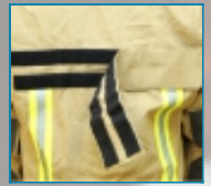
Detachable Back Writing