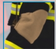
Pre-bent Ergonomic Elbows