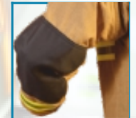
Aramid silicone Elbow Reinforcements