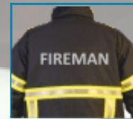
Silver Reflective Back Writing