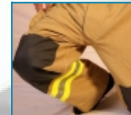
Aramid silicone Knee Reinforcements