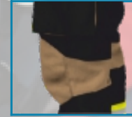
Pre-bent Ergonomic Knees