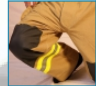
Aramid silicone Knee Reinforcements