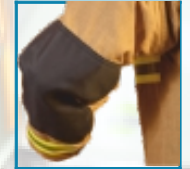
Aramid silicone Elbow Reinforcements