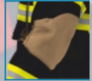
Pre-bent Ergonomic Elbows