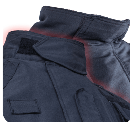
Jacket Collar Type