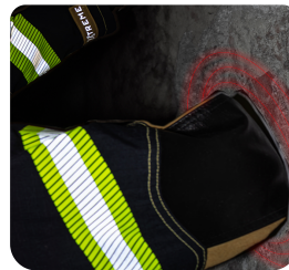
Aramid Felt Reinforcement on Elbow