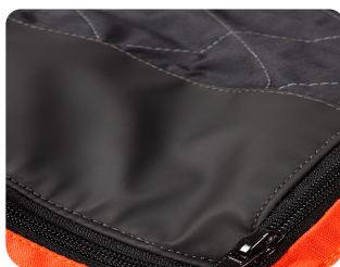
Waterproof Barriers on Leg Ends, Jacket Hem, and Cuffs