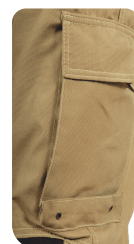
Drain Holes, Eyelet