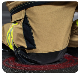
Aramid Felt Reinforcement on Knees