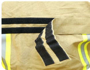
Silver Reflective Back Writing