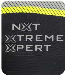
Gray Reflective Back Text