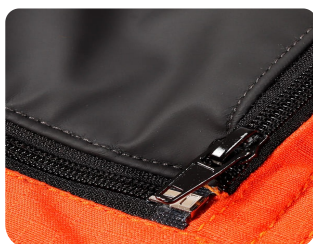
Detachable Inner Liner