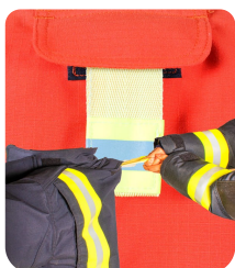
Aramid DRD (Drag Rescue Device)