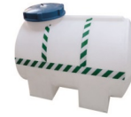
The Wastewater Tank