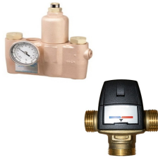
The Hot & Cold Water Mixing Valve