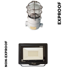
Internal and External Lighting