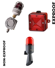
Visual Alarm for Shower