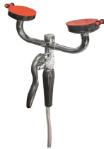
The Trigger Valve