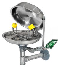
The Eye Wash Cover