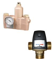
The Hot & Cold Water Mixing Valve