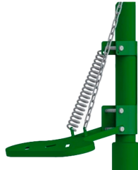
The Foot Pedal Controller