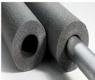
The Foot Pedal Controller