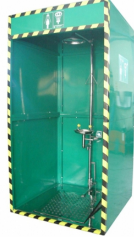
The Three-Sided Enclosed Cabin